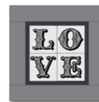
25" x 25"